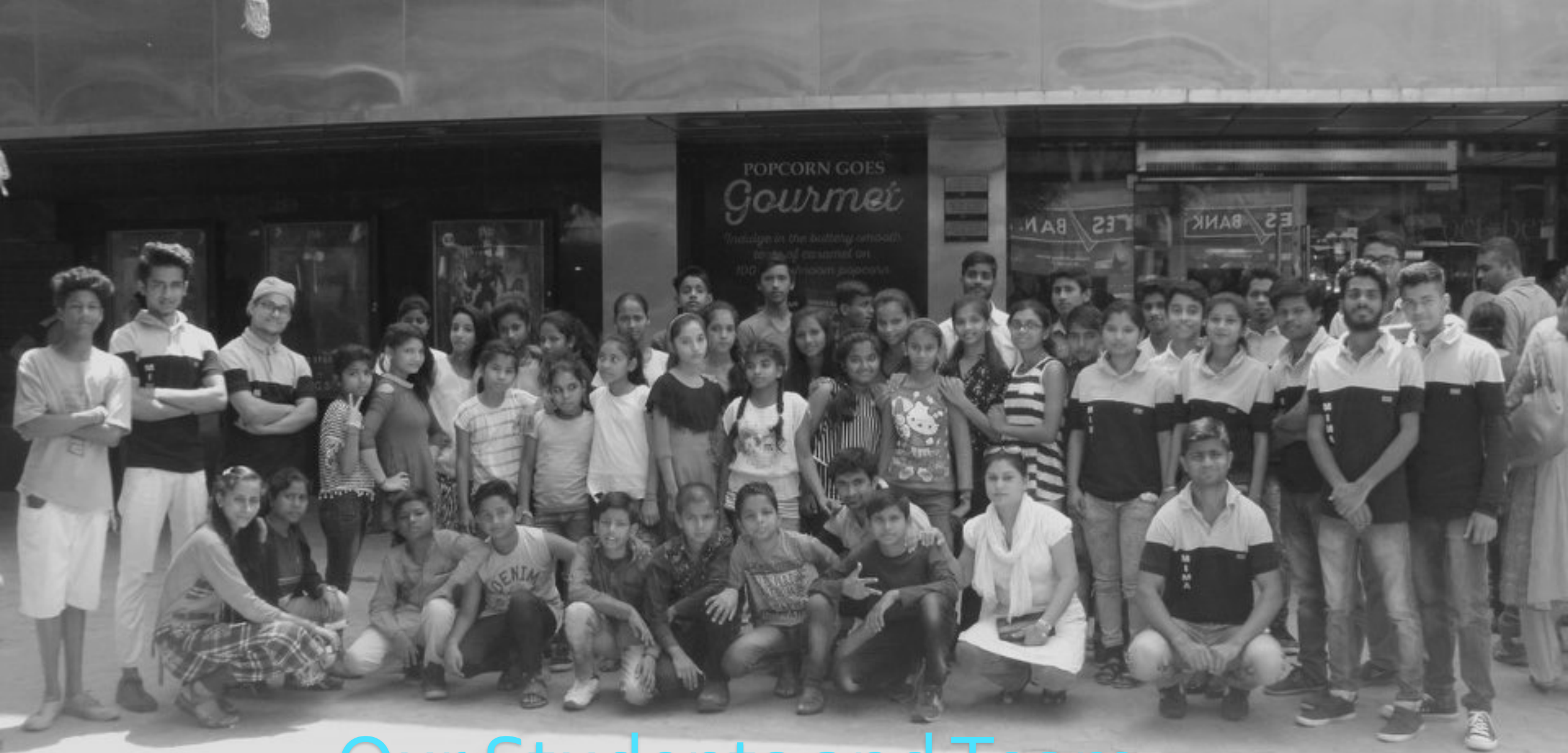
Our Students and Team