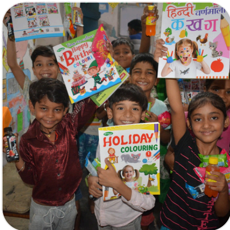
BOOK DONATION DRIVE