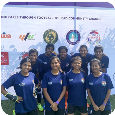
G4G MUMBAI VISIT