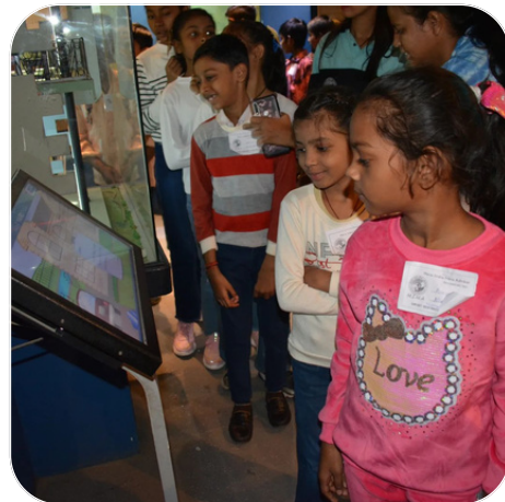
SCIENCE MUSEUM VISIT