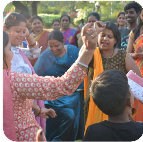
WOMENS DAY CELEBRATION