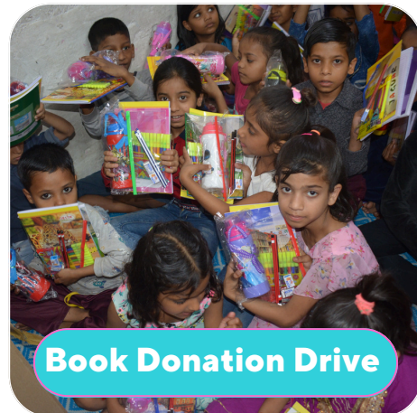
Book Donation Drive

We hosted events, rewarding and motivating children who showed remarkable improvement,