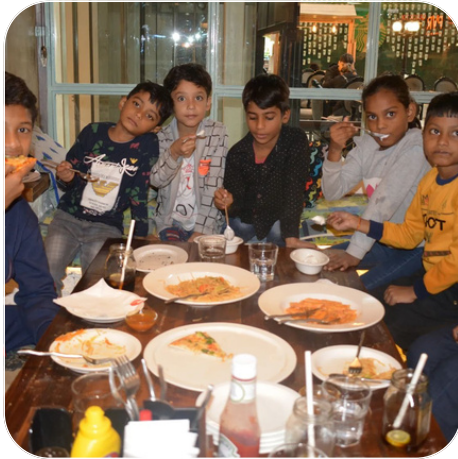
CHILDREN CAFE DELHI HEIGHT LUNCH