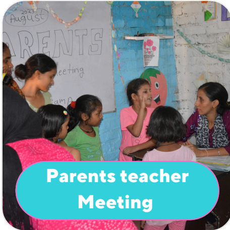
Parents teacher Meeting

Monthly PTMs engage parents in their children's education and progress.