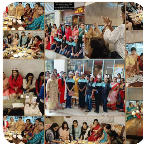
50 WOMENS CAFE DELHI HEIGHT VISIT